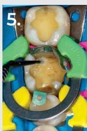
5. Scrubbing motion of Peak Universal Bond adhesive after Peak SE Primer application.