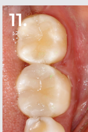
11. Final aspect of the restorations after occlusal adjustments and polishing. Note how the composite blends with the surrounding tooth structures and gives an esthetic and natural appearance on the proximal boxes without the use of any blocker shades.