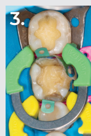
3. Trident® V3 sectional matrix system being placed, along with the anatomical wedges and rings.