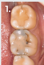
1. Before: Failed composite restorations on both lower molars.