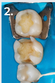
2. DermaDam™ rubber dam isolation after removal of the old restorations.