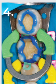
4. Ultra-Etch™ etchant selectively placed on the enamel margins. Peak™ SE Primer was used as the self-etching primer on dentin and Peak™ Universal Bond adhesive was used as the bonding agent.