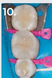
10. Both restorations finalized. Note the integration of the single Universal Body shade used with the surrounding tooth structure.