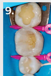
9. Transcend composite Universal Body shade applied over the lingual side of the first lower molar, already sculpted and light cured.