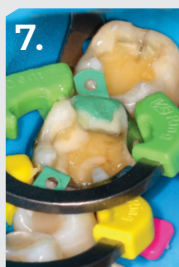
7. PermaFlo™ flowable composite (A2 shade) was applied over the cavity angles and on the proximal boxes to reduce stress during polymerization and to ensure a total and complete seal of the restoration margins, respectively. It also helps in avoiding air bubbles.