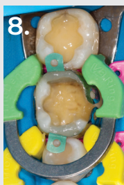
8. After curing PermaFlo flowable composite, Transcend™ composite Universal Body shade was used to create the missing mesial and distal walls.